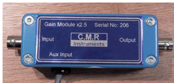
Optional Gain Unit x2.5